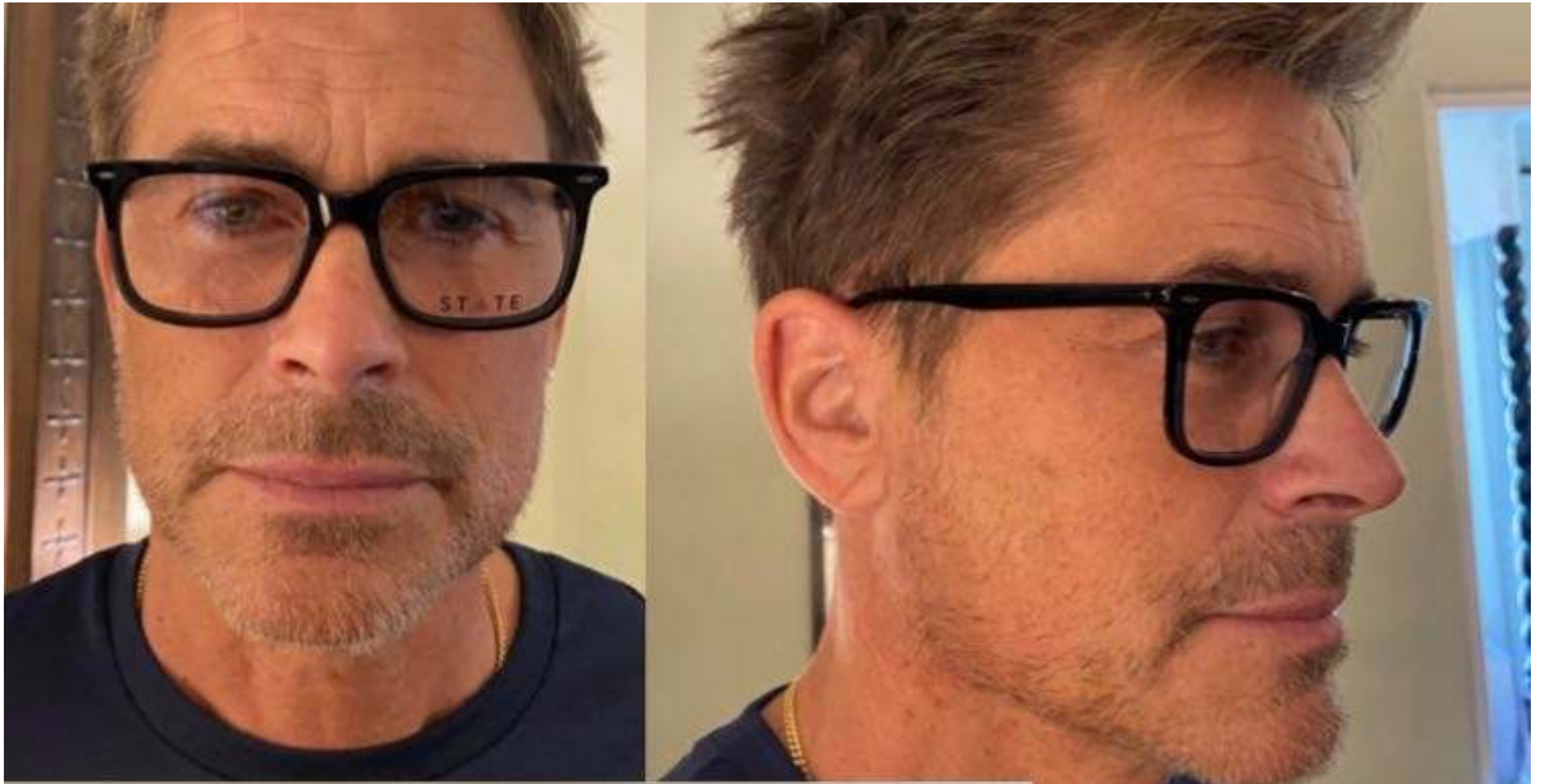
“HE IS A HEARTROB”